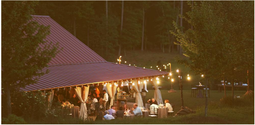
Things like local agriculture, social connections, and the ability to spend time in nature are all an important part of life at Serenbe and many other wellness communities