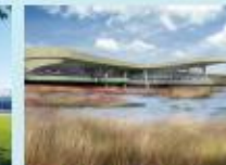
Nunduk Spa Retreat, Lake Wellington