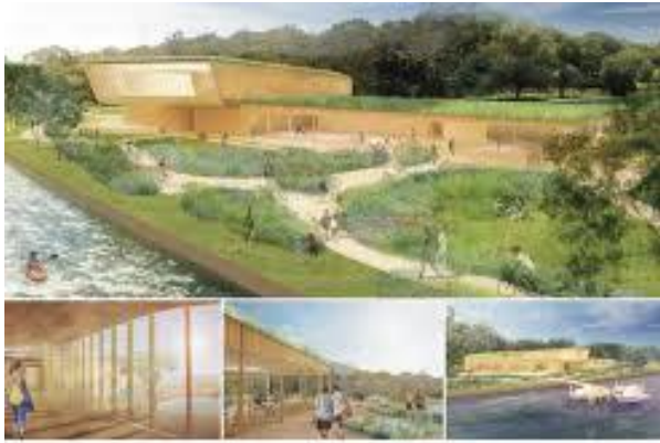
TAWARRI HOT SPRINGS

The Tawarri Hot Springs project is located on the banks of the Swan River in the south-west Perth suburb of Caversham. The project is to regenerate the landscape with a high quality spa facility and a demand free spring. Our design is largely overlooked as it is not in the public domain, making it most obvious only to those who visit the site for work and play.