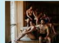
Peninsula Hot Springs, Mornington Peninsula