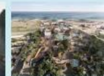
Saltwater Springs, Phillip Island