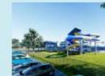
Gippsland Regional Aquatic Centre, Traralgon