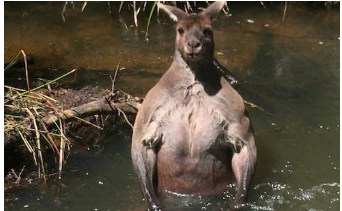
Kangaroo bathing in Boodjidup Creek in Margaret Rive, 2017