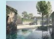
12 Apostles Hot Springs, Great Ocean Road