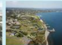
Metung Hot Springs, Gippsland Lakes