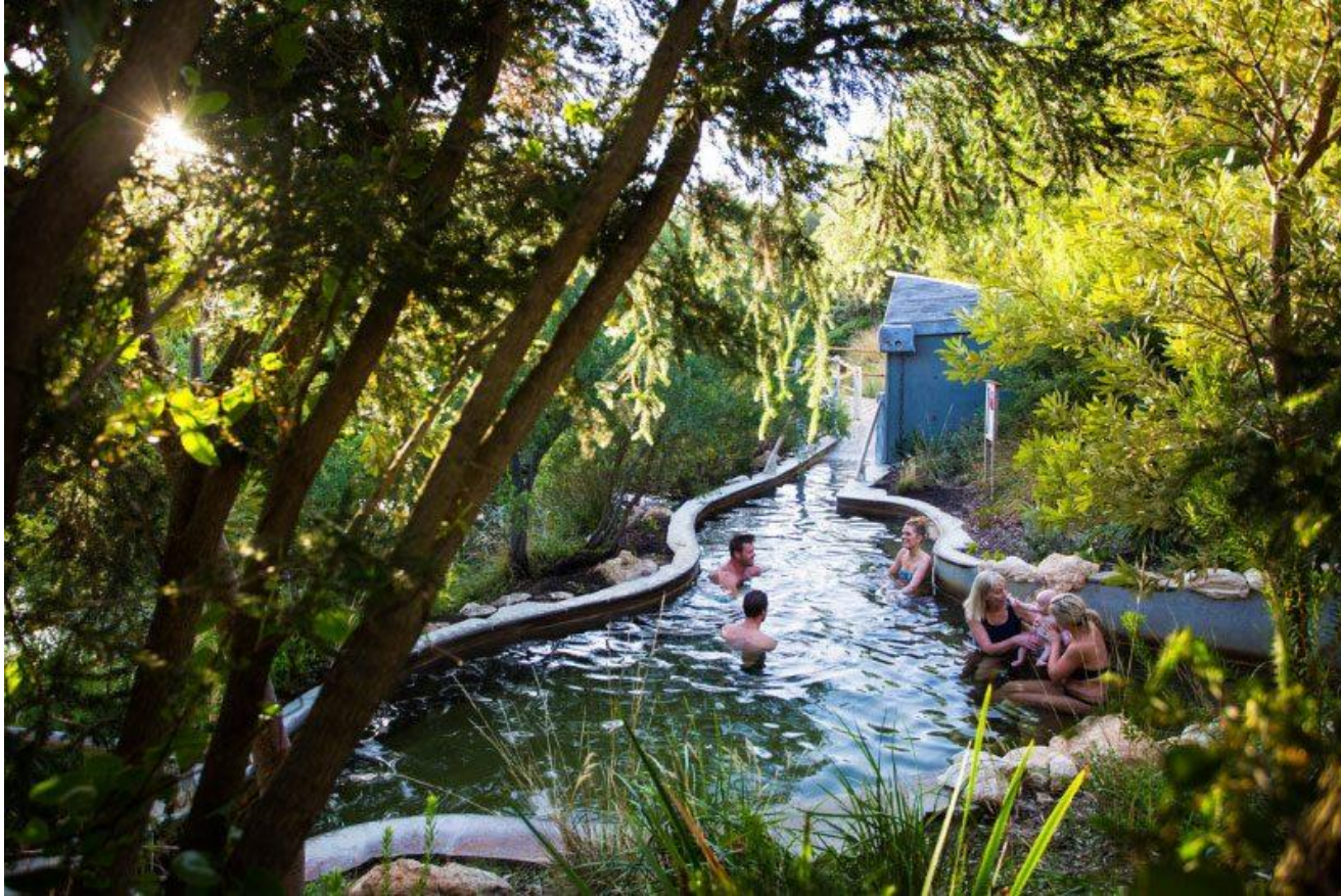
Peninsula Hot Springs