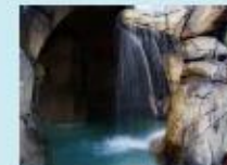
Deep Blue Hot Springs, Warrnambool