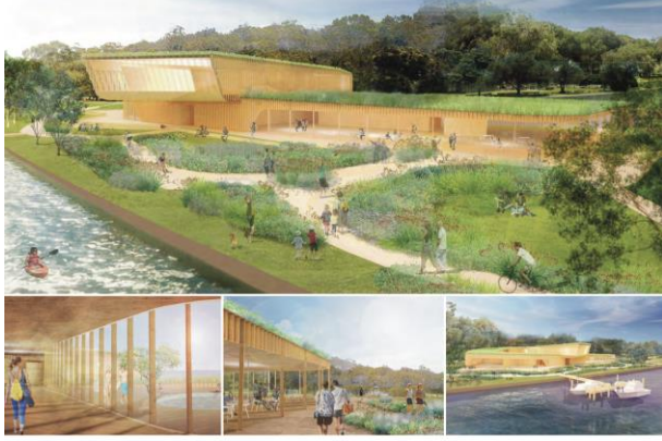
TAWARRI HOT SPRINGS

The Tawarri Hot Springs project is located on the banks of the Swan River in the established Perth suburb of Dalkeith. Our proposal is to reinvigorate the foreshore with a fluid, graceful spa located atop a dormant hot spring. Our design is largely unobtrusive as it nestles alongside the riverbank, creating a new destination point for Perth - built upon heritage and water.