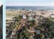
Saltwater Springs, Phillip Island